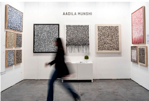
Example 1: Black, 11 inch artist name