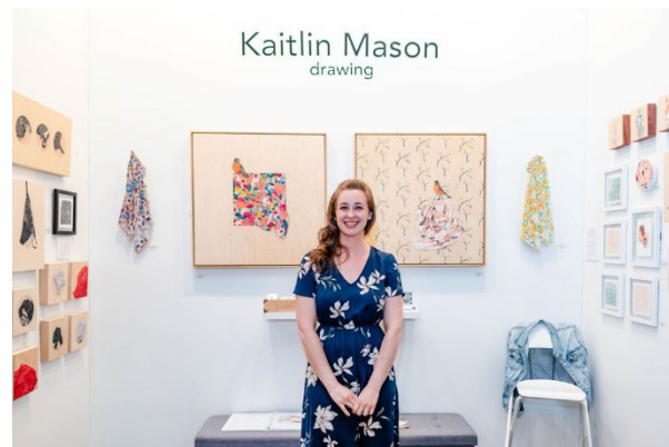
Example 2: Black, 11 inch artist name with medium