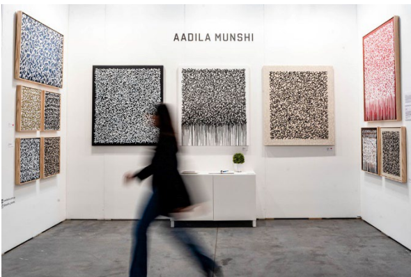
Example 1: Black, 11 inch artist name